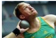
Figure 1 - Keep shot close to neck, under jaw or front of the ear