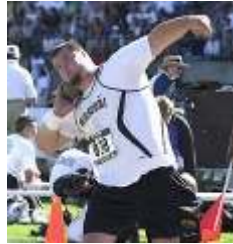
Figure 2 - Put weight onto back leg with hand not holding shot pointing to where it will be gong