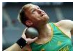
Figure 1 - Keep shot close to neck, under jaw or front of the ear