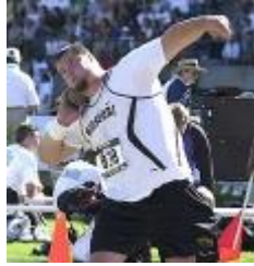
Figure 2 - Put weight onto back leg with hand not holding shot pointing to where it will be going