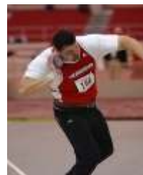
Figure 4 - Drive the hip forward