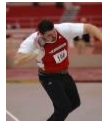
Figure 4 - Drive the hip forward